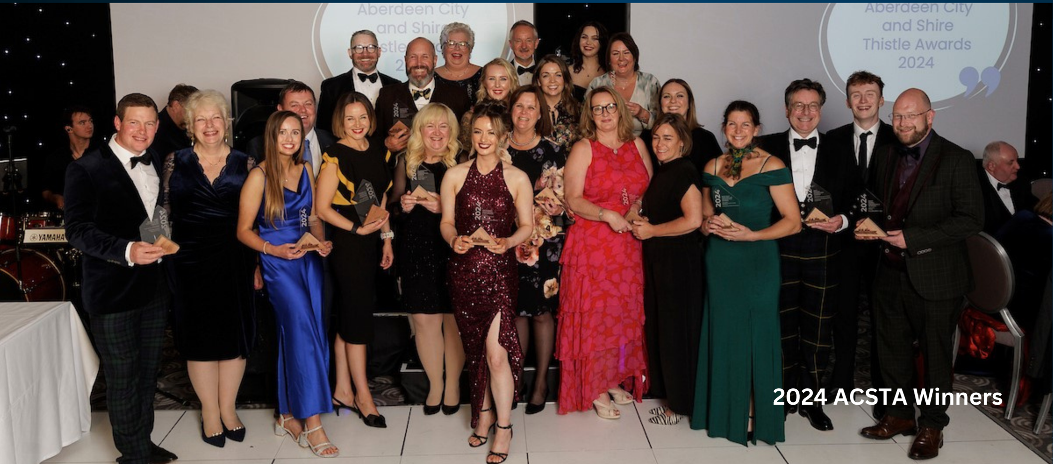
2024 ACSTA Winners